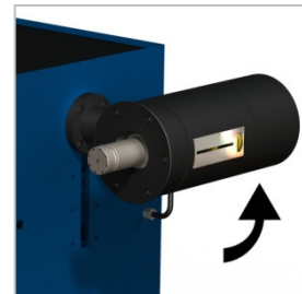
Working head rotated 90°