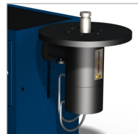
Support table Ø 480 mm